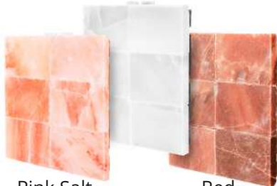
Pink Salt Panel