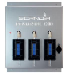
Powerzone 1200 Max Room Size 3000 cu ft