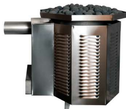
Model 280 80,000 BTU