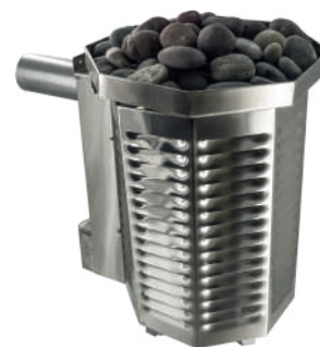
Model 240 40,000 BTU